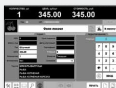
■ Operator Mode Interface