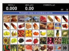
■ Self-Service Mode Interface