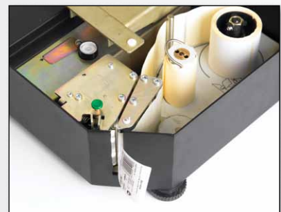
Robust Printer with Label-Out Indicator