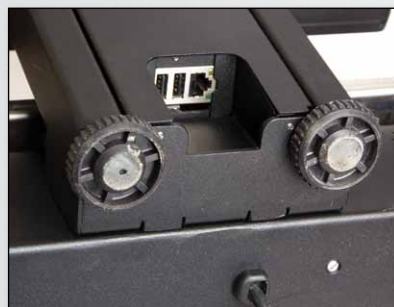
Wi-Fi, Ethernet and 2 USB ports as standard